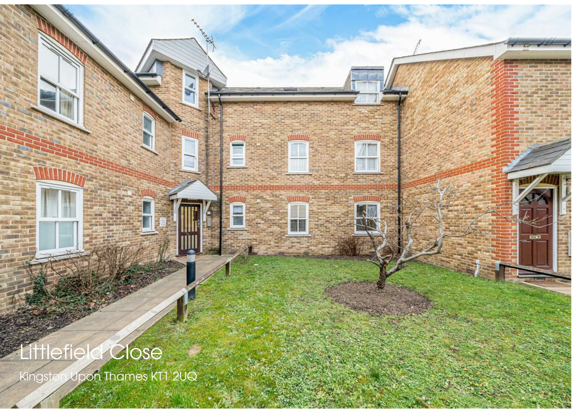
Littlefield Close Kingston Upon Thames KT1 2UQ